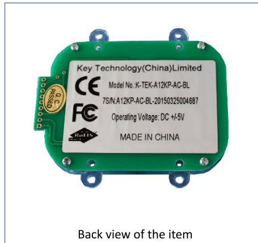
Back view of the item