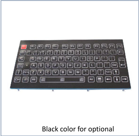
Black color for optional