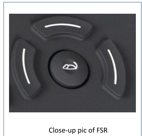
Close-up pic of FSR