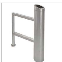
SWB_RL railing with built-in IR sensor